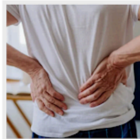
Improving Mobility & Flexibility