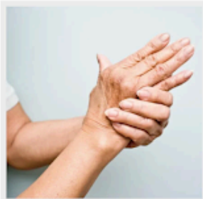
Relieving Osteoarthritis Symptoms