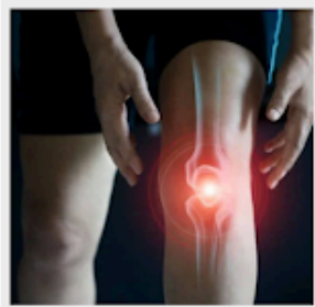
Promoting Cartilage Health