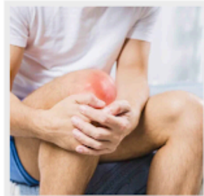
Reducing Joint Inflammation