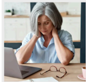
Increasing Energy & Vitality