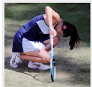
Enhancing Athletic Performance